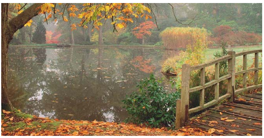
Exbury Gardens see page 13