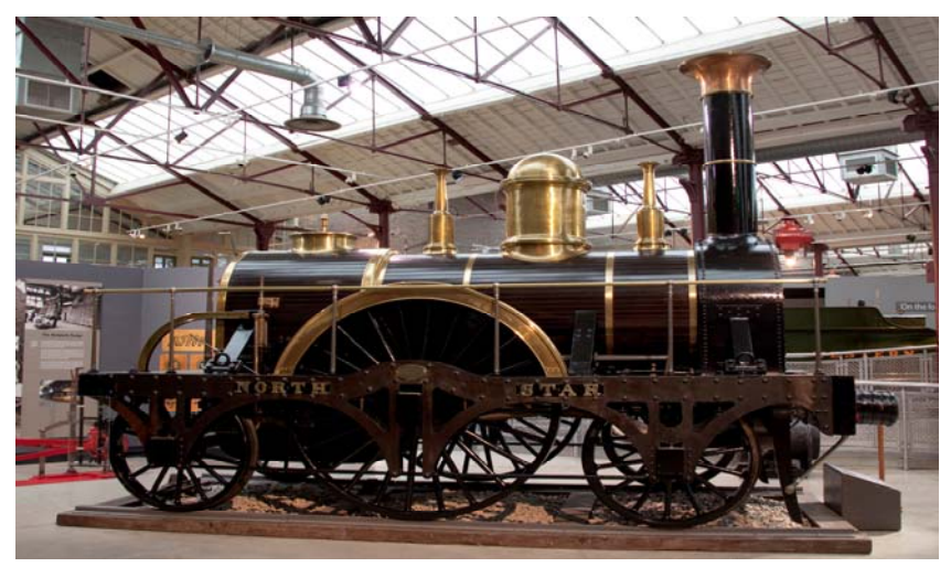
Steam Museum Exhibit