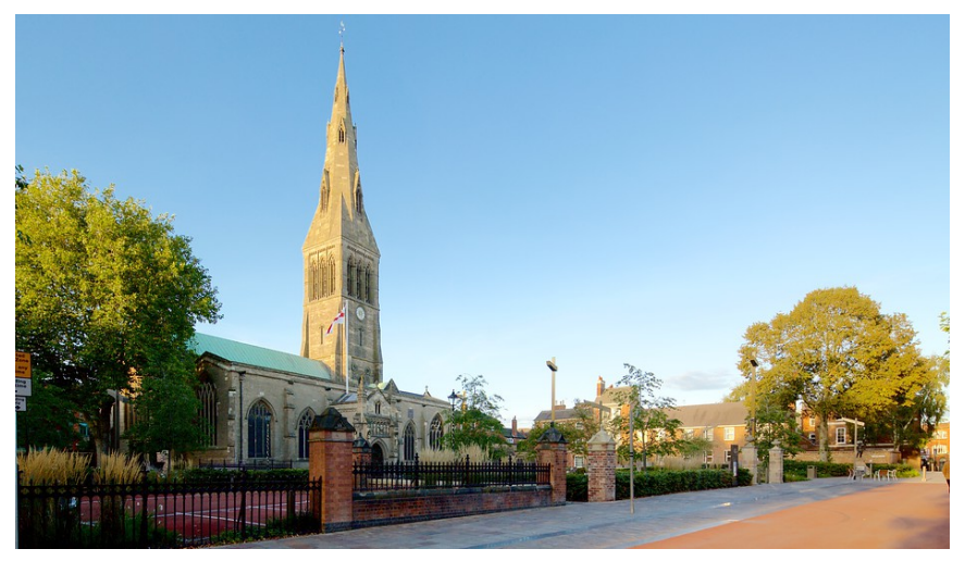
Leicester Cathedral for Richard III, see page 6