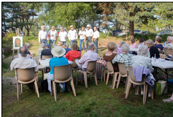
Members and guests enjoy listening to the Wareham Whalers at the BBQ in June 2019