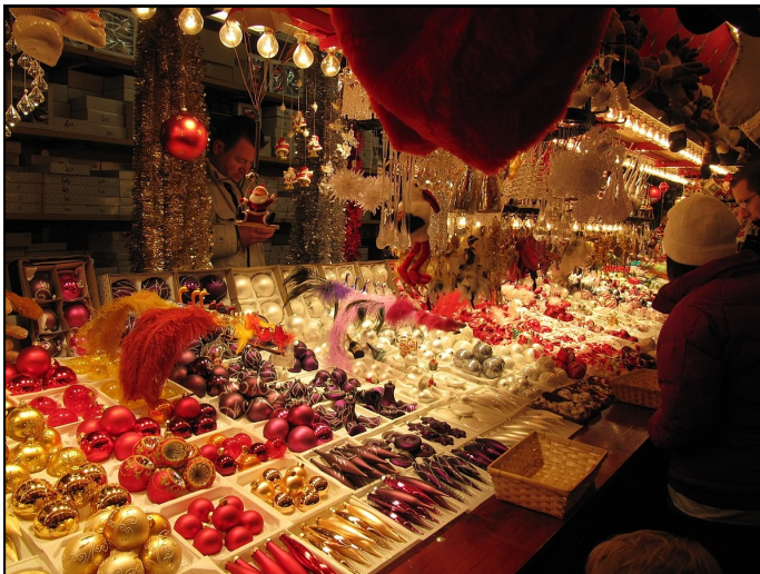
Christmas Market Scene